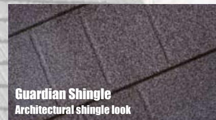
Guardian Shingle Architectural shingle look

Gerard Roofing Technologies Mesquite, TX • 866-295-9016 www.gerardusa.com